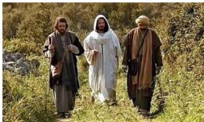
On the road to Emmaus